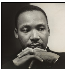
Dr. Martin Luther King, Jr. Day January 17, 2022