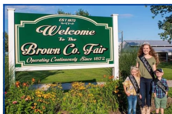
Brown County Fair August 3—8, 2021

We have a limited number of COVID Vaccination Card Holders. Keeping your card safe and in a convenient location is important. Contact the Brown or Pike County RSVP office if you would like one.