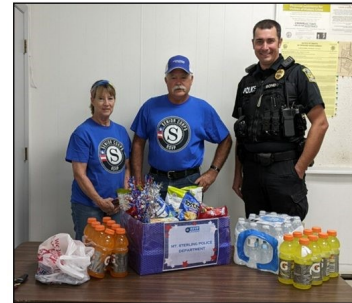
Mt. Sterling Police Department