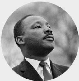
MARTIN LUTHER KING JR. SOCIAL ACTIVIST | 1929–1968

Please bring contributions to the Brown County RSVP Office located at 108 N. Capitol, Mt. Sterling, IL 62353, or to the Pike County RSVP Office located at 39637 260th Ave, Pittsfield, IL 62363. Contact information and office hours are on the back of this newsletter. We will gladly get them delivered to the Liberty Chapter. RSVP had a very successful drive last year—let's see if we can do the same in 2024!