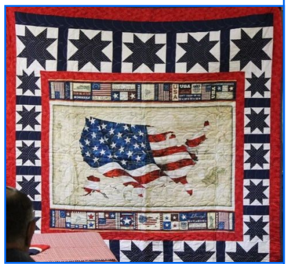
This is one of the Quilts of Valor presented to Veterans.